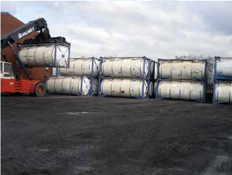
Tank movement and leasing