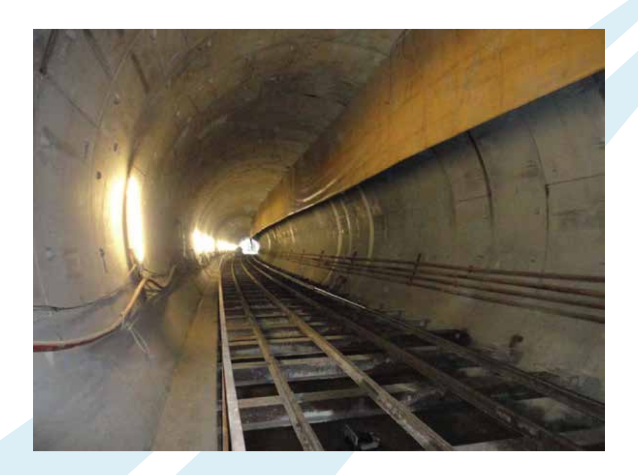
Marmaray Bosphorus tunnel project Turkey

400×40ft high cube containers stc fire protection cement based application