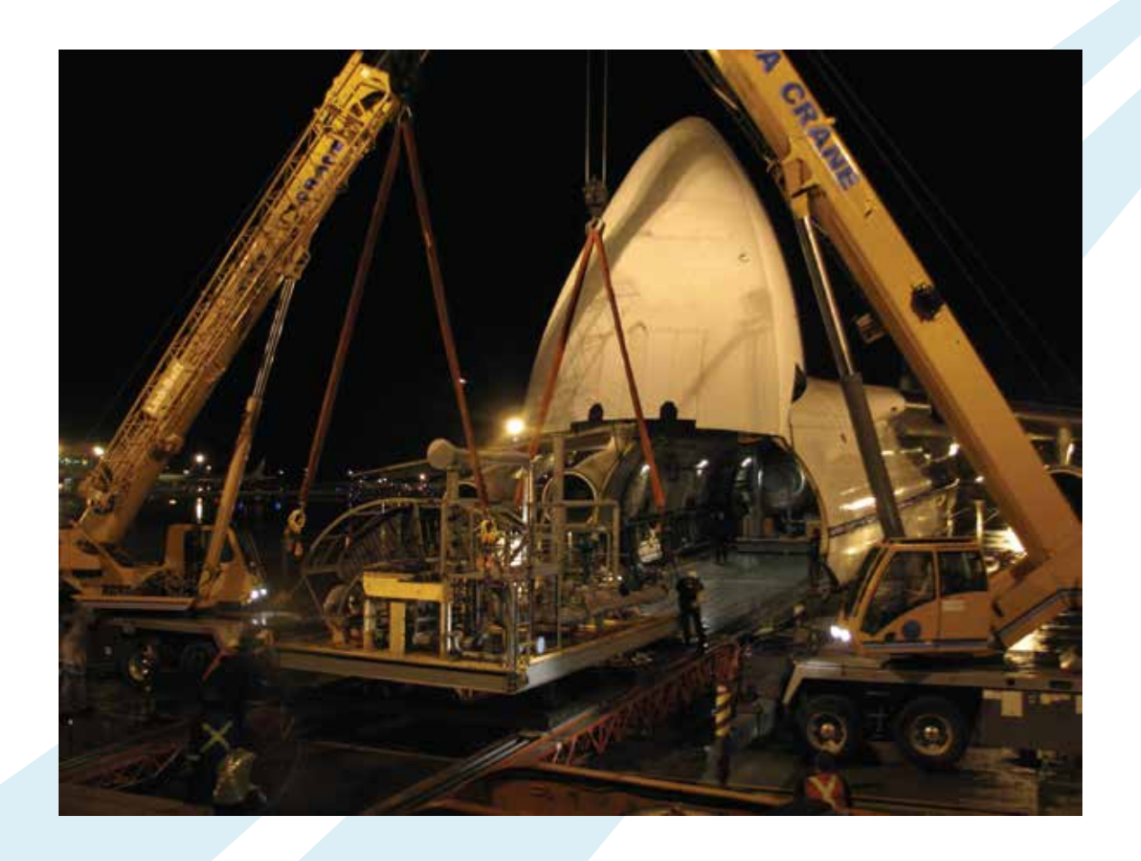
Panafrican Petroleum Gabon

Air charter from Calgary, Canada to Port Gentil, Gabon Wireline Unit – 2x4.27x3.78m, 52T