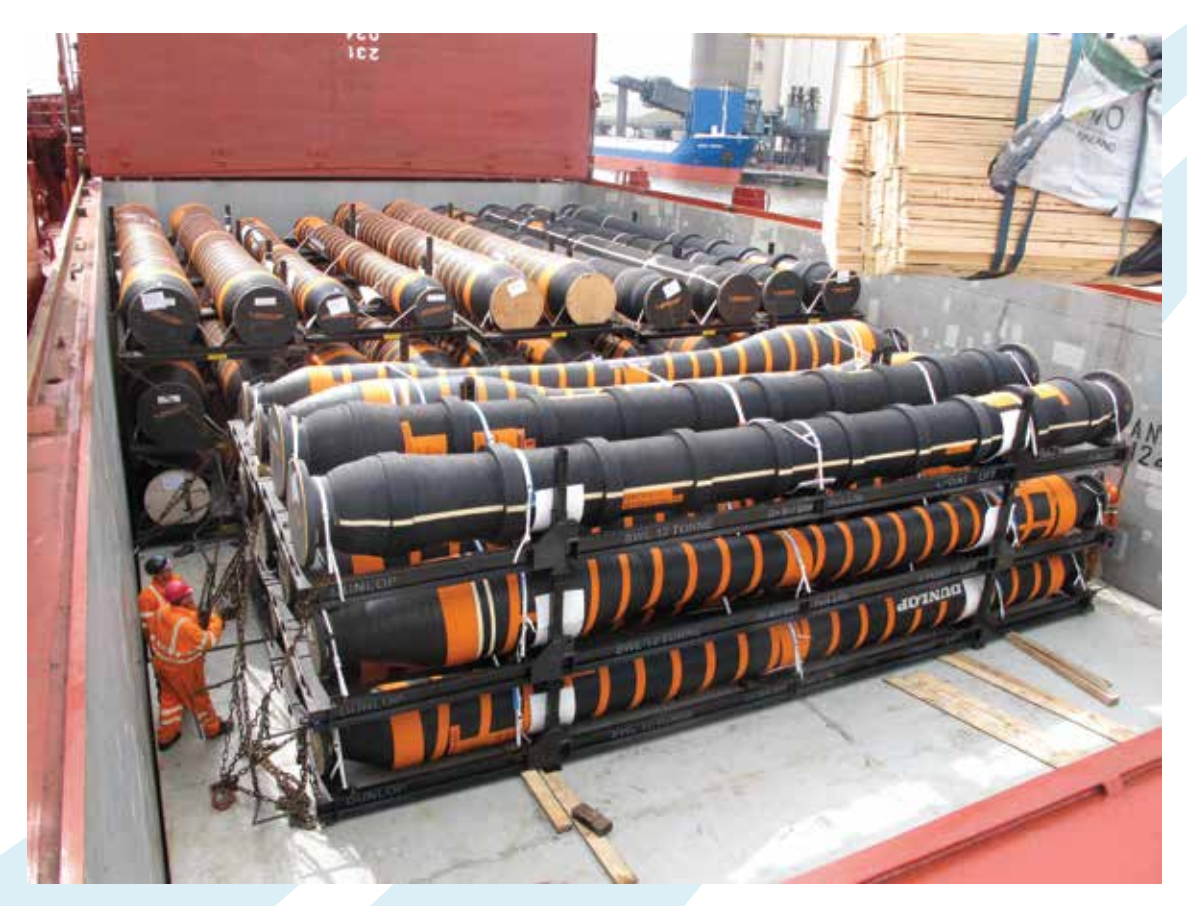
17870 Jose Calm Buoy project Venezuela

From England to Venezuela Vol. 3100 m³, 727T